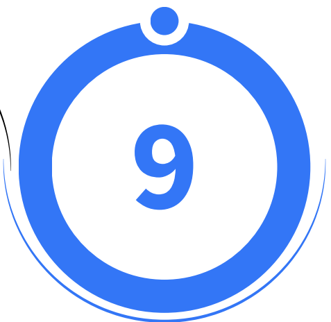
MONTHS TO PROMOTION