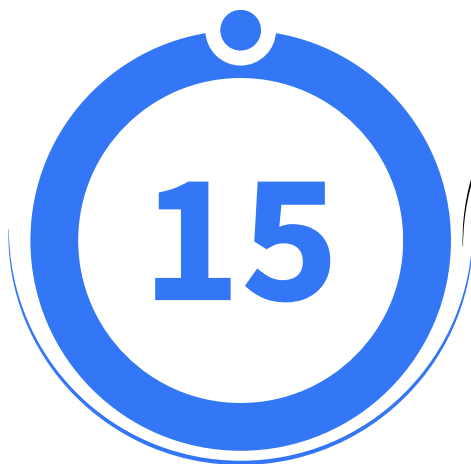
TOTAL HIRES FROM SHIFT GROUP

“Shift Group candidates fostered a true team environment, allowing us to scale quickly. Their contributions enabled us to exceed targets, justifying the addition of more reps and unlocking further growth potential.”