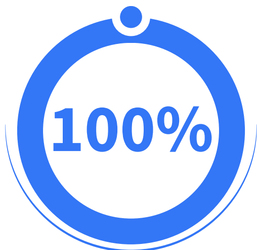
KPI's & OTE

“Our Shift Group candidate excels at collaboration, connecting with her teammates to bring out the best in each other. Together, the team quickly learn what works and what doesn’t, turning their experiences into valuable lessons for the team’s growth”